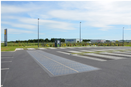
Lidl supermarket Moul, France

50 m 2 power a charging station for electric vehicles