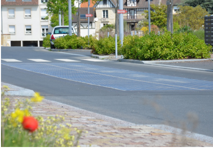
SEM Normandie Epron, France

A 50 m 2 section powers a display panel (with battery)