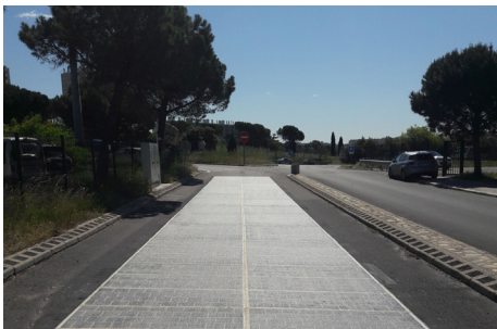
DIRMED Septèmes-les-Vallons, France

The electricity produced by the 50 m 2 is used to provide power to the supermarket.