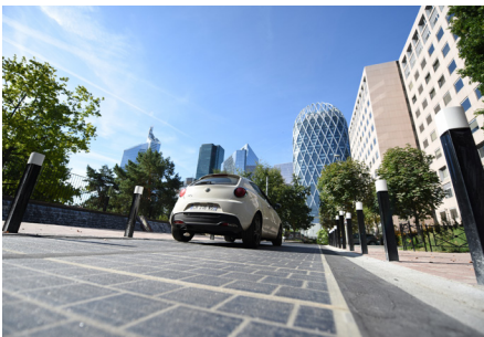
Paris La Defense Courbevoie (92), France

The electricity produced by the 100 m 2 is used to provide a source of power to the municipal swimming pool.