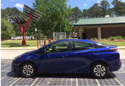
The Ray West Point, Georgia, USA

The electricity produced by the 50 m 2 is used to provide power to Tourist Bureau of the State of Georgia