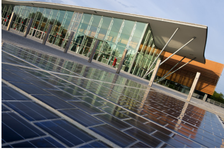
Vendéspace Mouilleron-le-Captif, France

50 m 2 power a charging station for electric vehicles