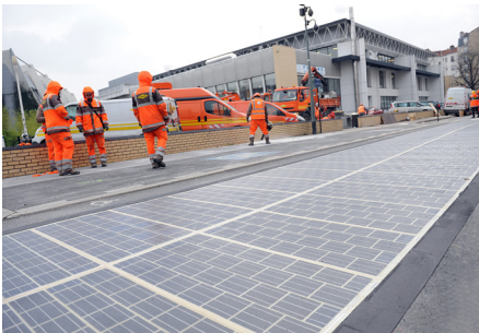
Greater Paris Seine-Ouest Boulogne-Billancourt, France

A 50 m 2 section powers a display panel (with battery)