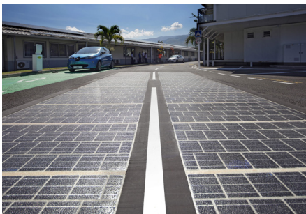
Private office building Le Port - Reunion Island, France

The electricity produced by the 2,800 m 2 is reinjected in the Enedis network.