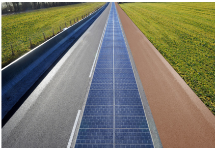
Route RD 5 Tourouvre, Normandy, France

The electricity produced by the 50 m 2 is used to provide power to Tourist Bureau of the State of Georgia